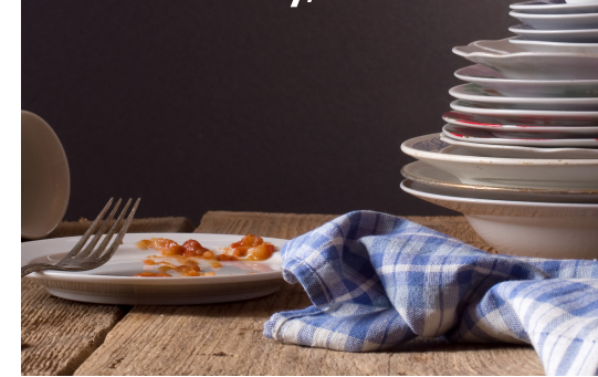
Sunday, 13 March