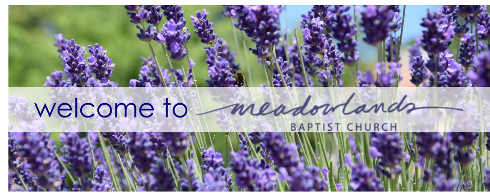
June 2, 2019

PRAYER MEETING (CHURCH LIBRARY, ROOM 206)